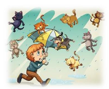
It's raining cats and dogs

Okay, here's why this is a lot easier than what all those commentators say and you can google it and some of you already are, I saw you out there, and you can check out what the rest of them say. But here's what's so simple, in the Hebrew language they use idioms just like we do. An idiom is like you take a number of words to make a complicated subject simple, or you just use a bunch of other words to try to say something that you don't normally say. So we say it's raining cats and dogs, can you picture